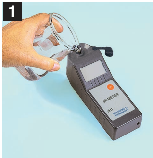
Rinse and fill cell cup