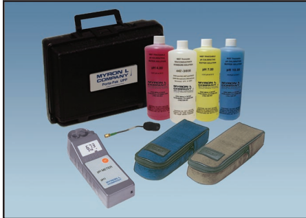
The TechPro Line of Accessories: pH Buffers, Standard Solution, Replacement pH Sensor, & choice of Soft or Hard Protective Carrying Case