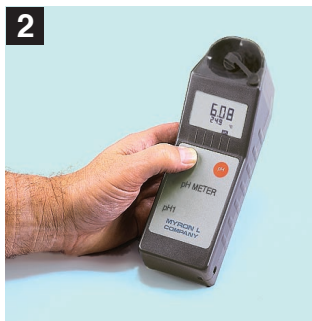
Push button, and take reading