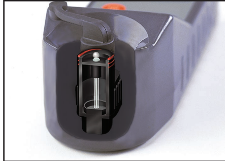
The pH sensor chamber protects a large-capacity KCl reservoir guarantees extended life and can be easily replaced by the user.